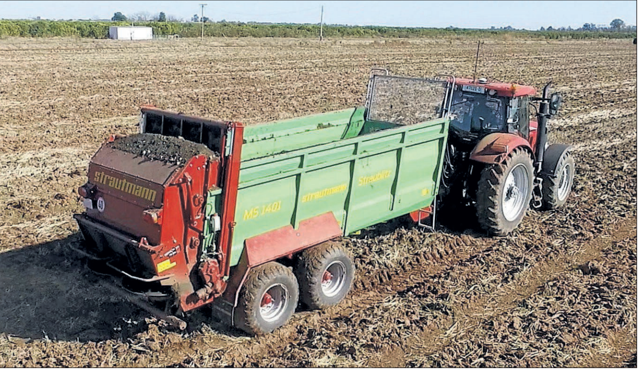
The Strautmann MS 1401 Universal Spreader can spread a wide range of organic and mineral material from fine compost or crumbly lime to heavy manure.

Not all spreaders can handle different types of product, but the Universal Strautmann machines can spread a wide range of organic and mineral material from fine compost or crumbly lime to heavy manure.